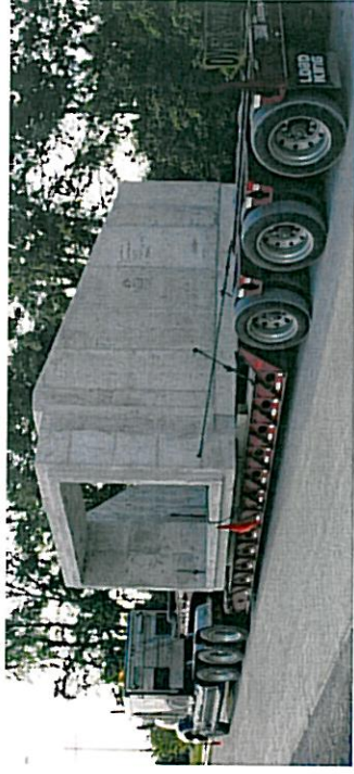
12 x 8 Box Culvert End Section