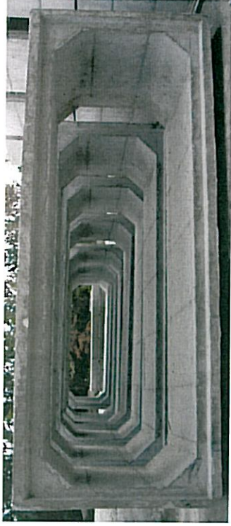
17 x 5 Box Culvert