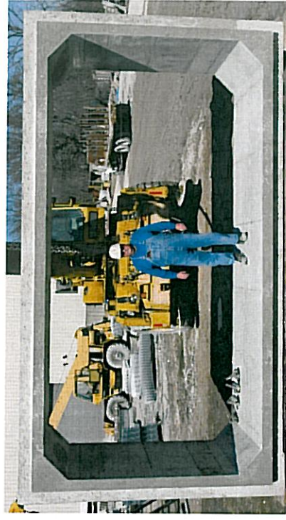
18 x 9 Box Culvert