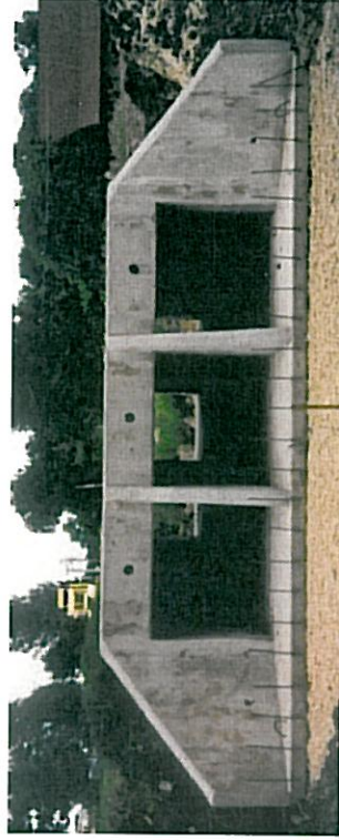
Triple 5x4 Box Culvert Flared End Section