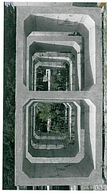
Twin Cell 6 x 6