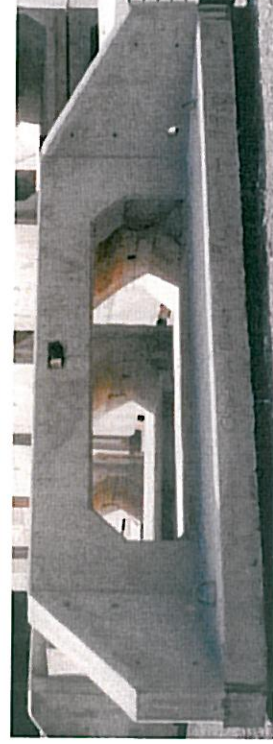
8 x 2 Box Culvert Flared End Section