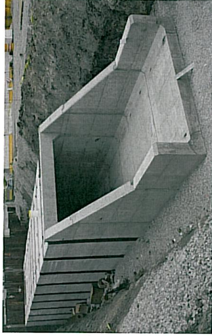
12 x 8 Box Culvert